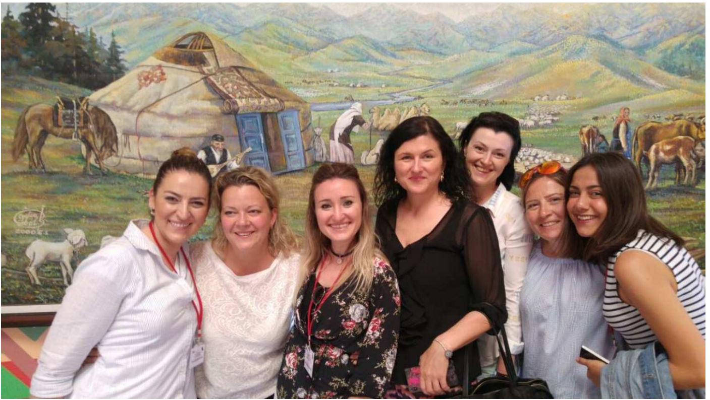
4. The importance of "horse" in the culture of Otağ and the nomadic Turkish life is mentioned. We were also introduced "kımız", our national drink which means mare's milk equivalent to mother's.